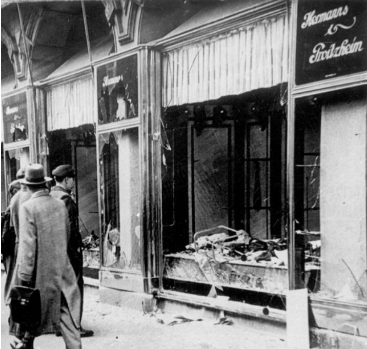
Shop damage in Magdenburg.

Highland Park Conservative Temple Congregation Anshe Emeth