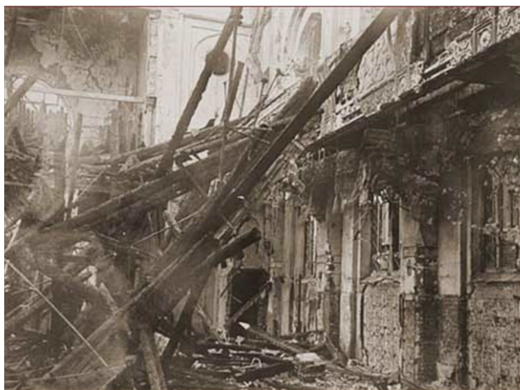
Synagogue in Aachen Destroyed on Kristallnacht.